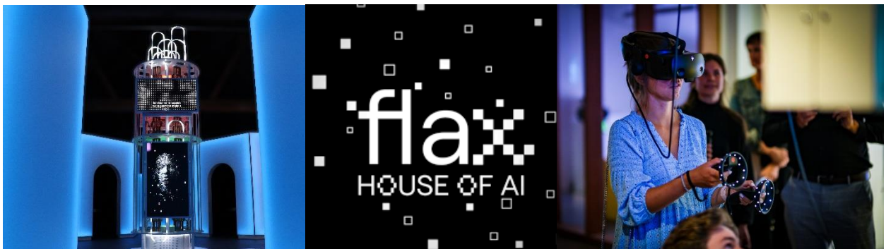
Flax - Kortrijk