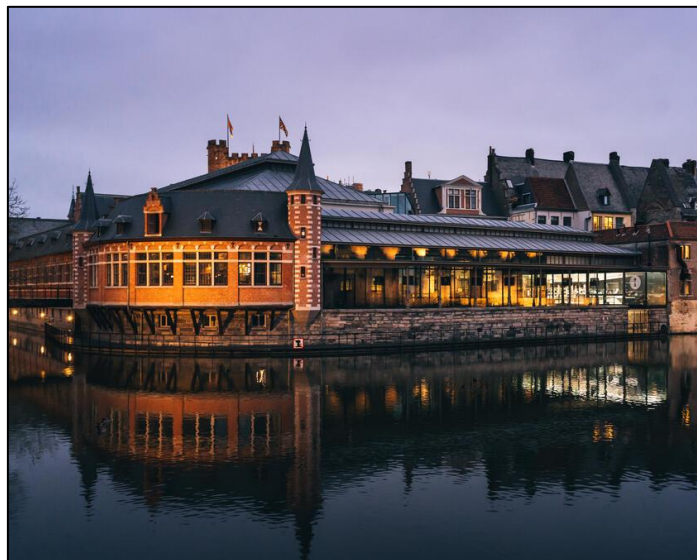
Oude Vismijn Gent – gala venue