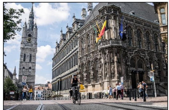
Gent City Hall